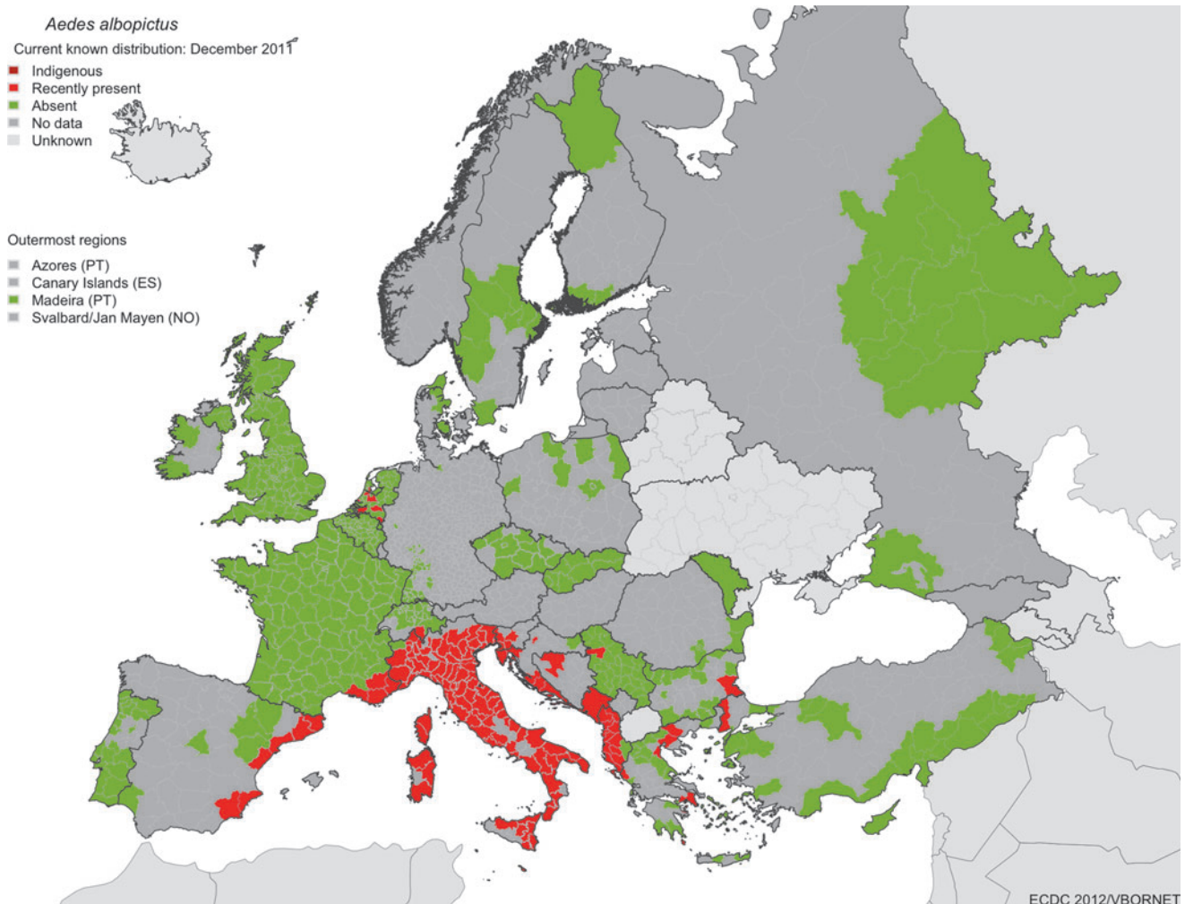
FIG. 1. The currently known distribution of Aedes albopictus in Europe in September 2011. The most recent updated map can be downloaded from www.vbornet.eu (ES, Spain; PS, Portugal; NO, Norway).

as one of the top 100 invasive species by the Invasive Species Specialist Group (Invasive Species Specialist Group 2009), and is considered to be the most invasive mosquito species in the world. Aedes albopictus originated in Southeast Asia, but has spread during the last 30–40 years (Paupy et al. 2009) to North, Central and South America, parts of Africa, northern Australia, and several countries in Europe. Since its first appearance in Albania in 1979 and Italy in 1990, A. albopictus has been reported in 20 European countries (Fig. 1 and Table 1), including Albania, Belgium, Bosnia and Herzegovina, Croatia, France (including Corsica), Germany, Greece, Italy (including Sardinia and Sicily), Malta, Monaco, Montenegro, the Netherlands, San Marino, Serbia, Slovenia, Spain, Switzerland, and the Vatican City (European Centre for Disease Prevention and Control 2009; Gatt et al. 2009; Petric 2009), as well as Bulgaria, where it has been recently reported (O. Mikov, personal communication) and Turkey (O. Alten, K. Oter; personal communication). It is unclear whether populations in some countries of northwestern Europe will establish, particularly into the Netherlands, as the populations found in greenhouses are thought to be non-diapausing strains imported from southern China on lucky bamboo (Scholte et al. 2007). However, strains recently introduced to the